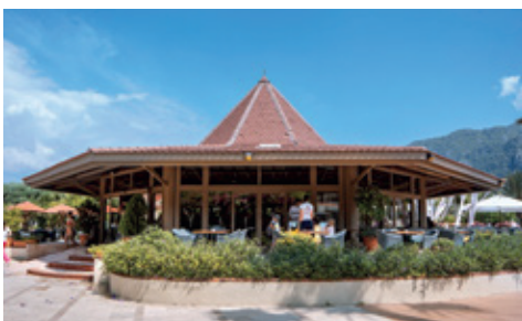
Otag Bar ( Mimoza & Mediterranean Fish Restaurant )