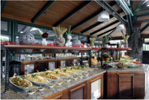
Kapadokya & Terrace Restaurant