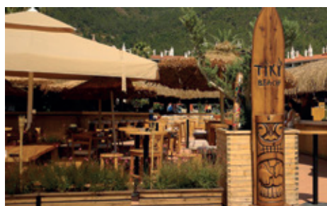
Tiki Beach Restaurant & Bar