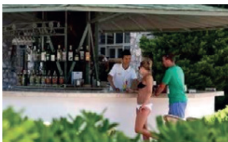
Nimara Snack Bar